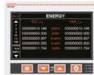
Energy consumption control